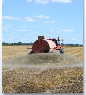
Fertilizer is typically applied during winter and spring, which are the riskiest times of year for runoff from rain and snowmelt. Runoff from only a few large events can be a significant proportion of annual nutrient losses from agricultural areas. Understanding farmers' information needs and creating tools to meet them will help farmers get the timing right to keep their nutrients on the land.