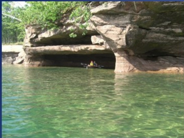
Madeline Island (Apostle Islands) Wisconsin