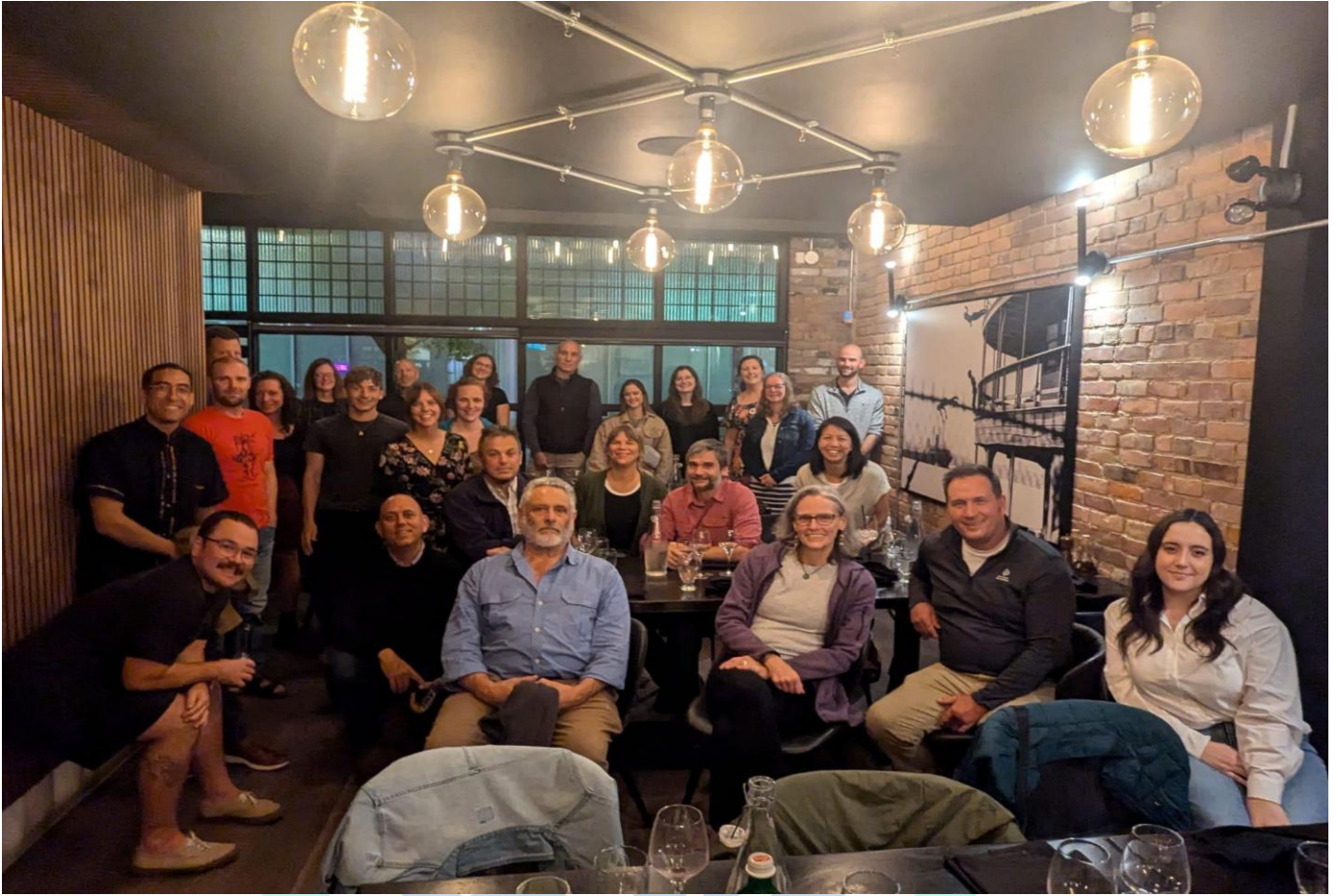
Figure 2 Group photo of participants at networking event