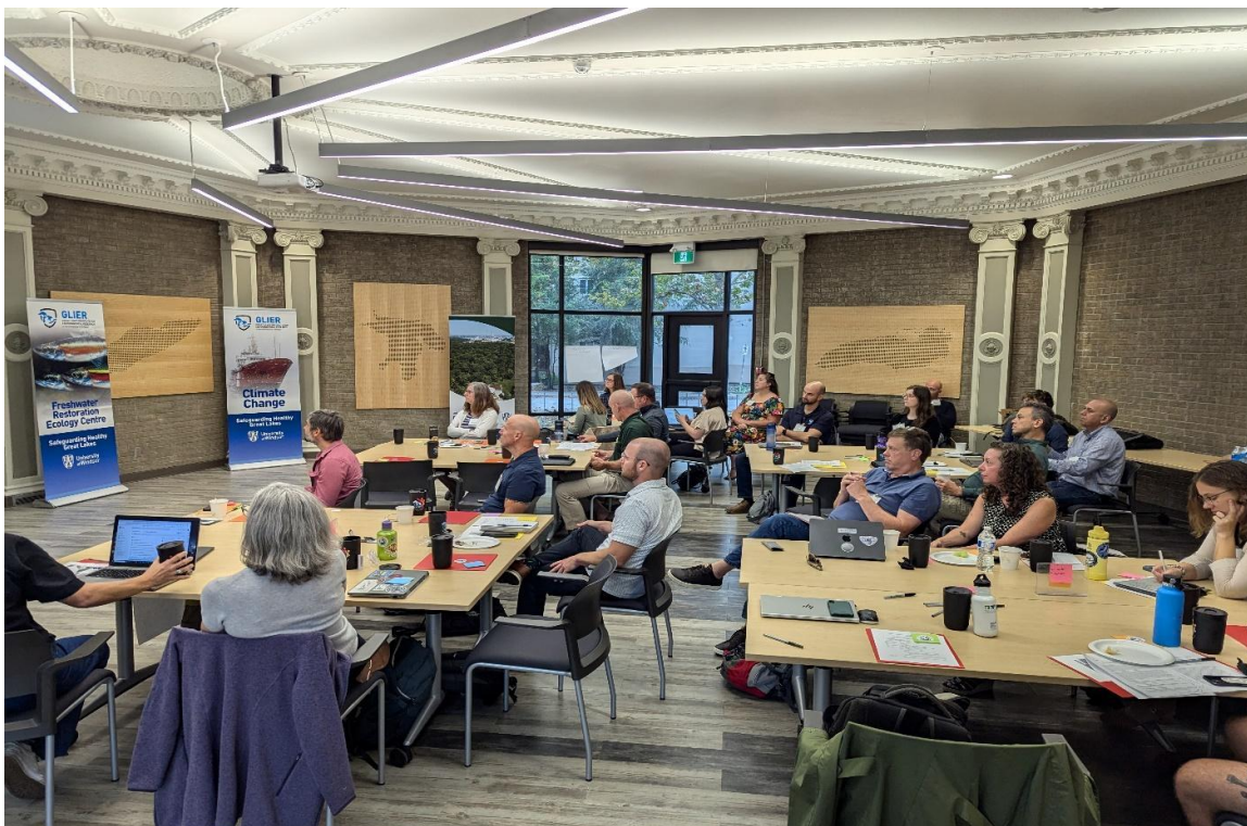
Figure 1 Photo of Day 1 of Summit held at Great Lakes Institute of Environmental Research at the University of Windsor, ON